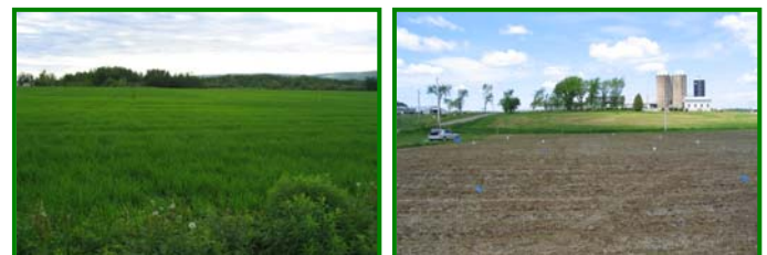
Fig. 1. Demonstration of a PPNT for grain (left) and PSNT for corn.