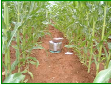
Fig. 2. Sampling technique for GHG emissions.

Soil samples are obtained (30 cm depth) prior to planting and/or fertilization, and bi-weekly throughout the growing season. A post-harvest soil analysis is completed to determine excess N in the soil. Climatic information, crop yield, crude protein content and thousand-kernel weight were recorded at each site where appropriate. The production of N 2 O is measured at the same time as soil sampling, in order to gain a better understanding of emissions during the growing season.